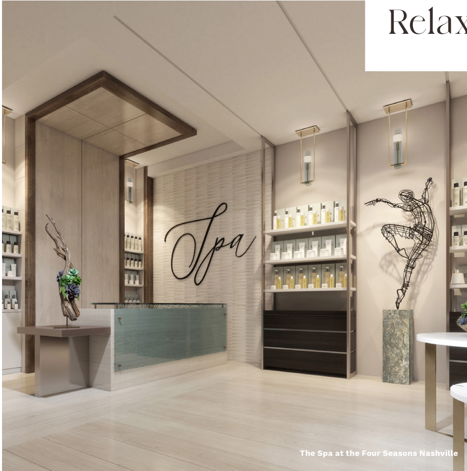
The Spa at the Four Seasons Nashville