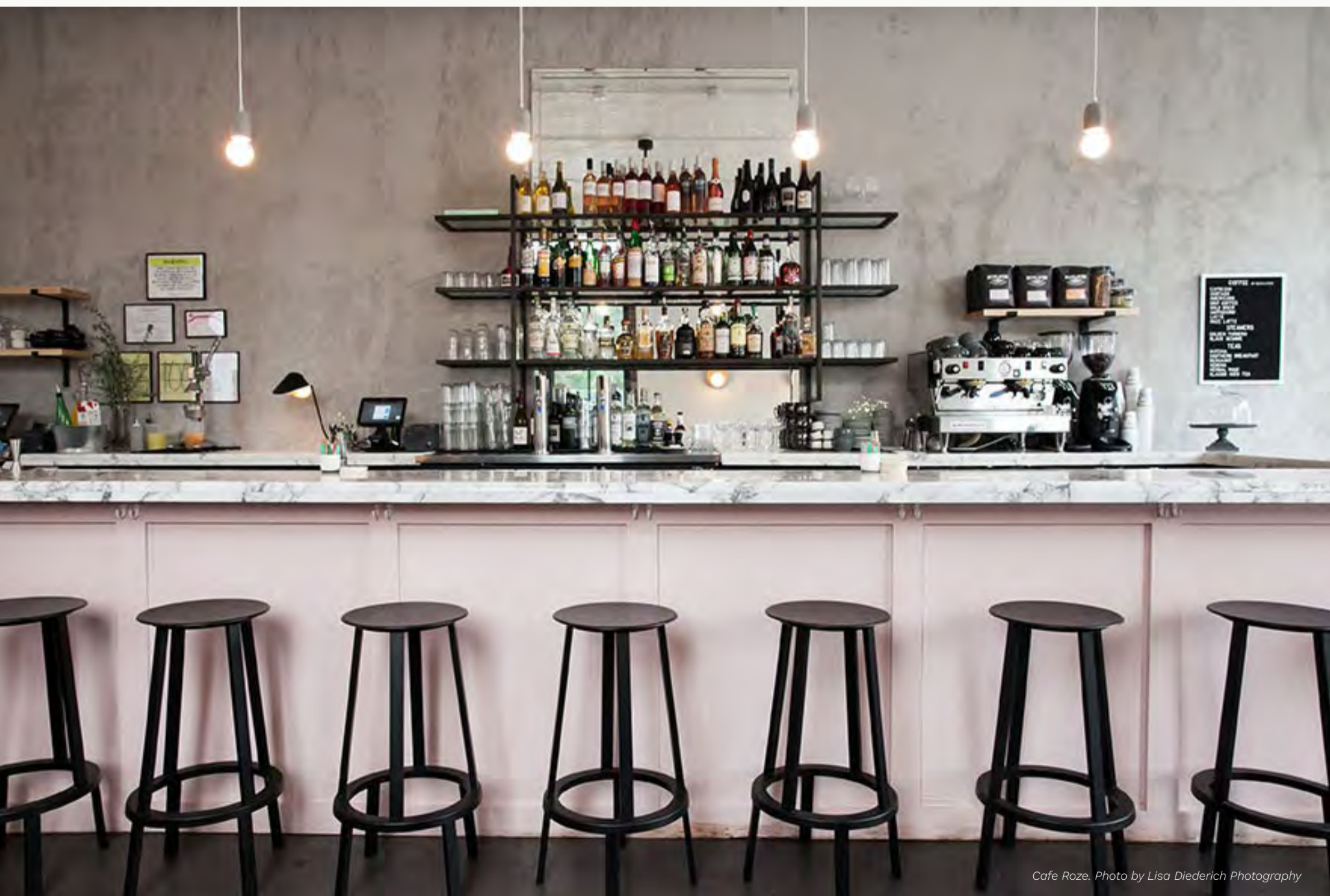
Cafe Roze.

Serve with pita or your favorite toasted bread.