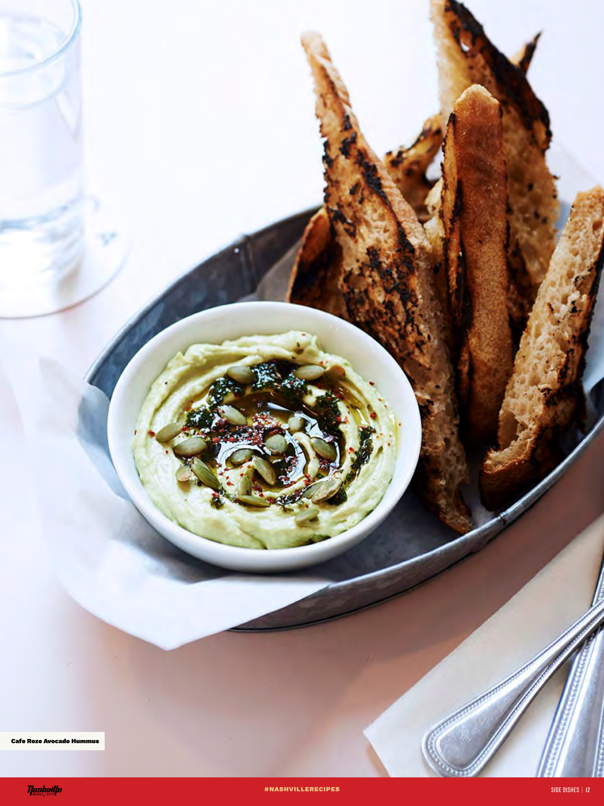
Cafe Roze Avocado Hummus