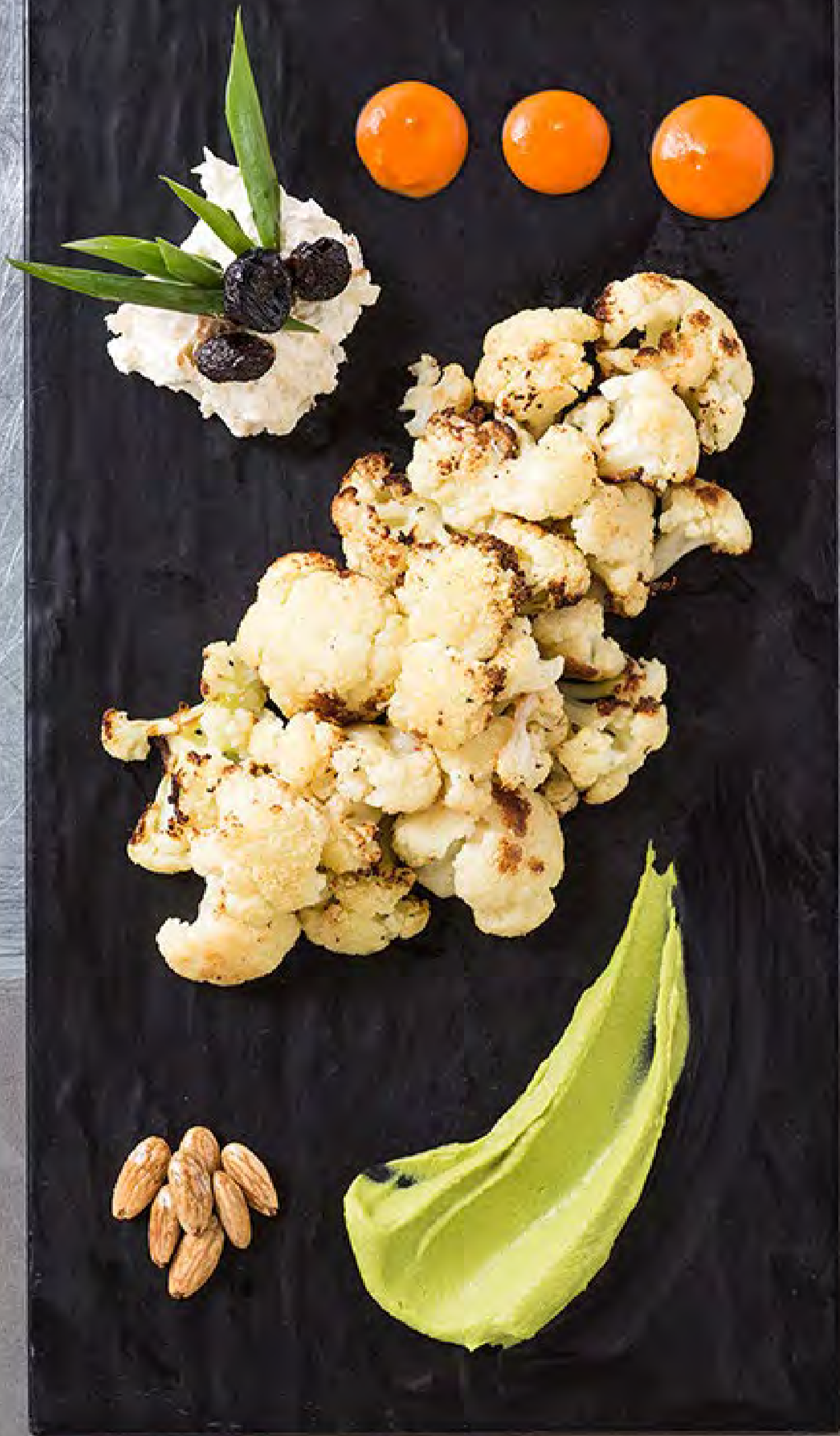
Roasted Cauliflower with Truffled Pea Pesto, Red Bell Essence & Feta Cream