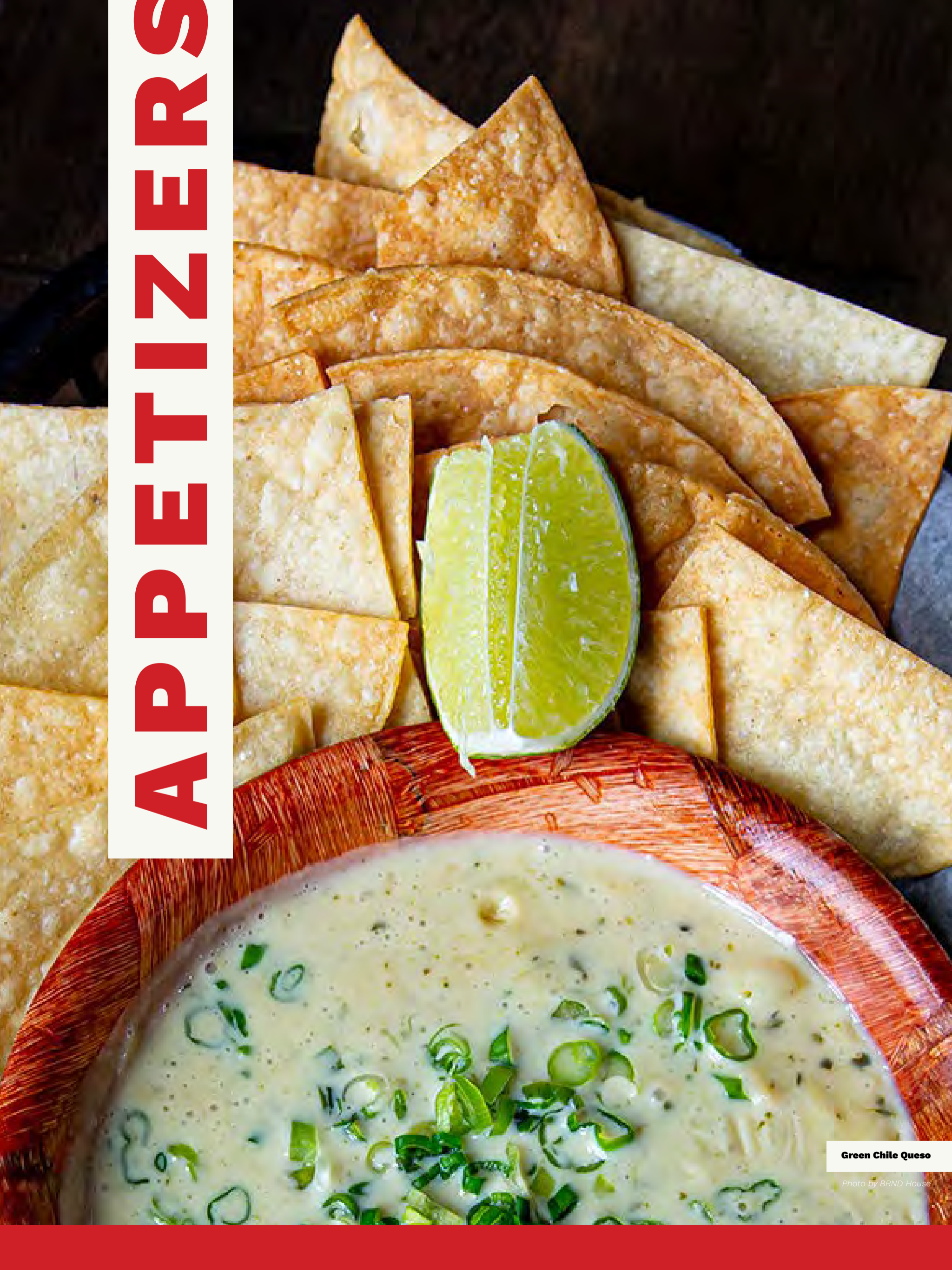
Green Chile Queso