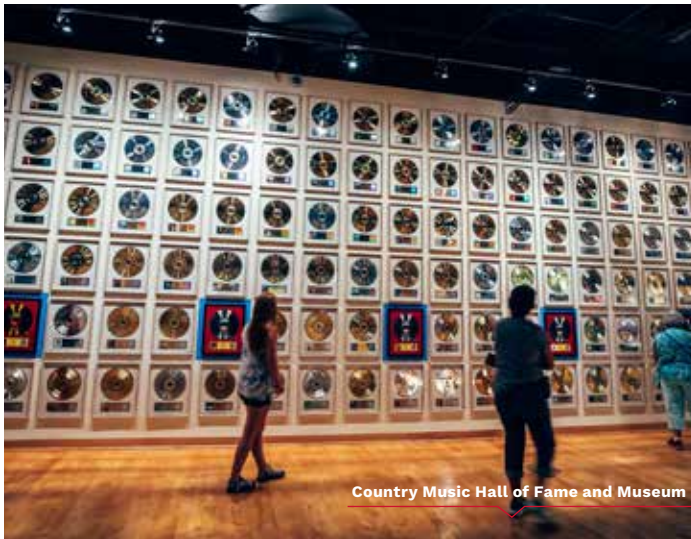
Country Music Hall of Fame and Museum

Festivals of Music April 5-6; April 12-13; April 26- 27, 2025