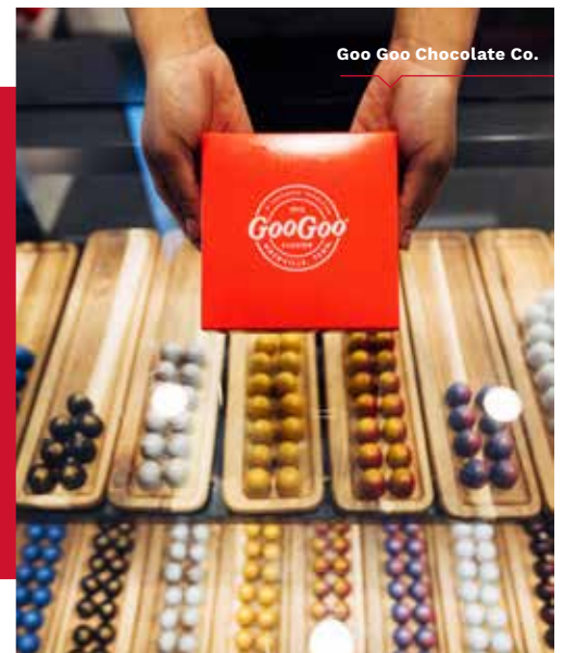
Goo Goo Chocolate Co.