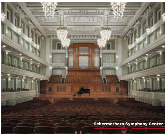
Schermerhorn Symphony Center