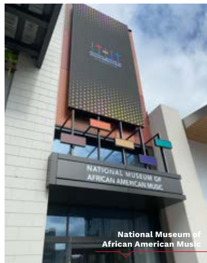
National Museum of African American Music