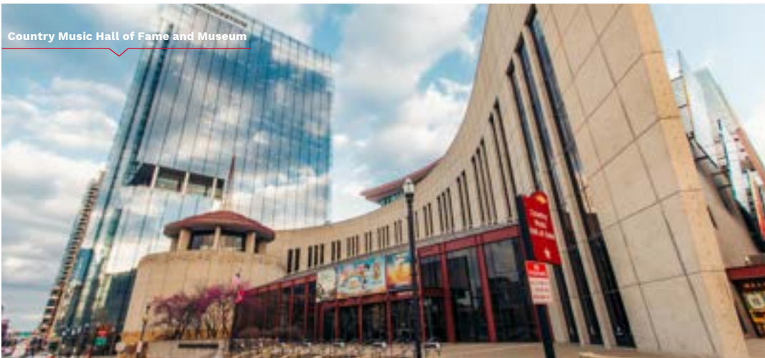
Country Music Hall of Fame and Museum