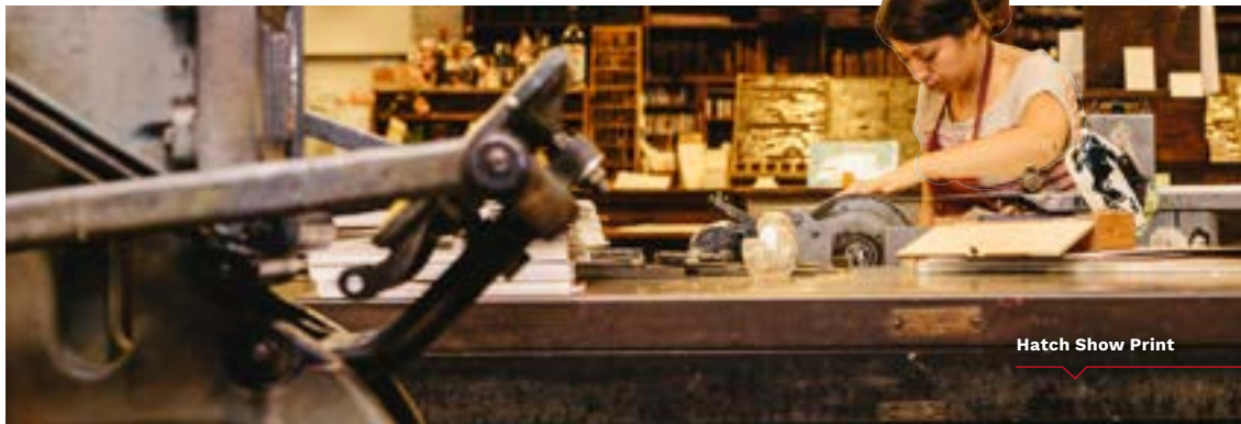
Hatch Show Print