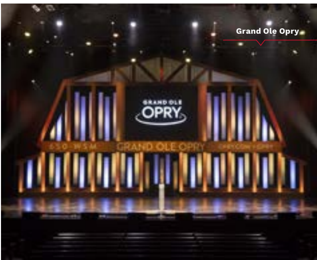
Grand Ole Opry